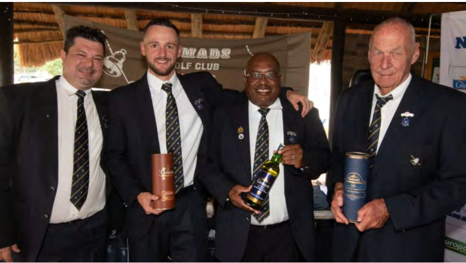
Glenbrynth Whisky Draw (f.l.t.r)