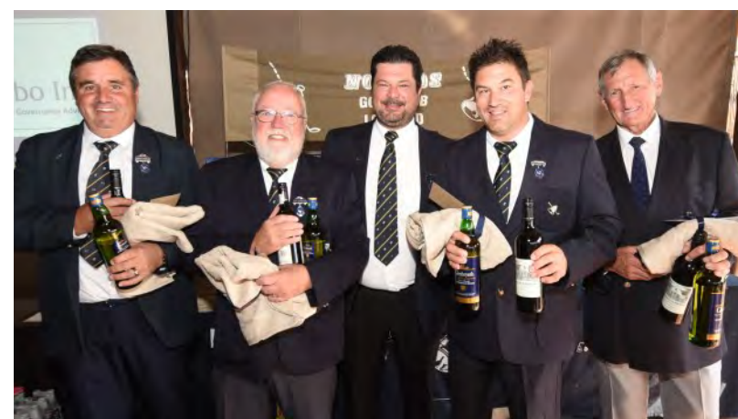
Winning 4-ball were (f.l.t.r.):